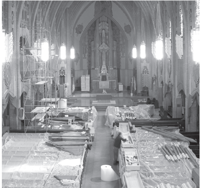
An overview of the church while the Organ Clearing House was removing the organ

Note that neither JAV Recordings nor I will in any way financially benefit from any of the fund-raising activities, and I have donated services to see this through. $40 is the minimum donation, which may be made by check payable to the church or credit-card payment online.